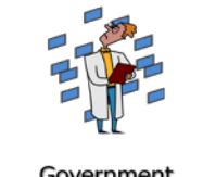
Government Regulatory Affairs