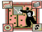
Sales & Marketing