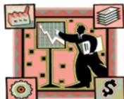
Sales & Marketing